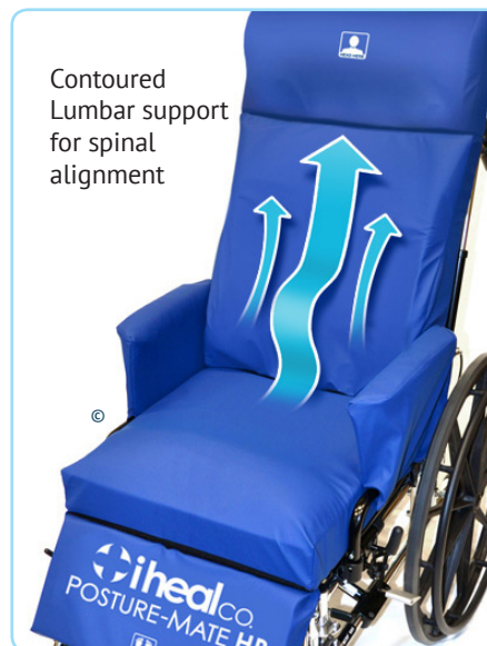
Independently mounted contoured headrest